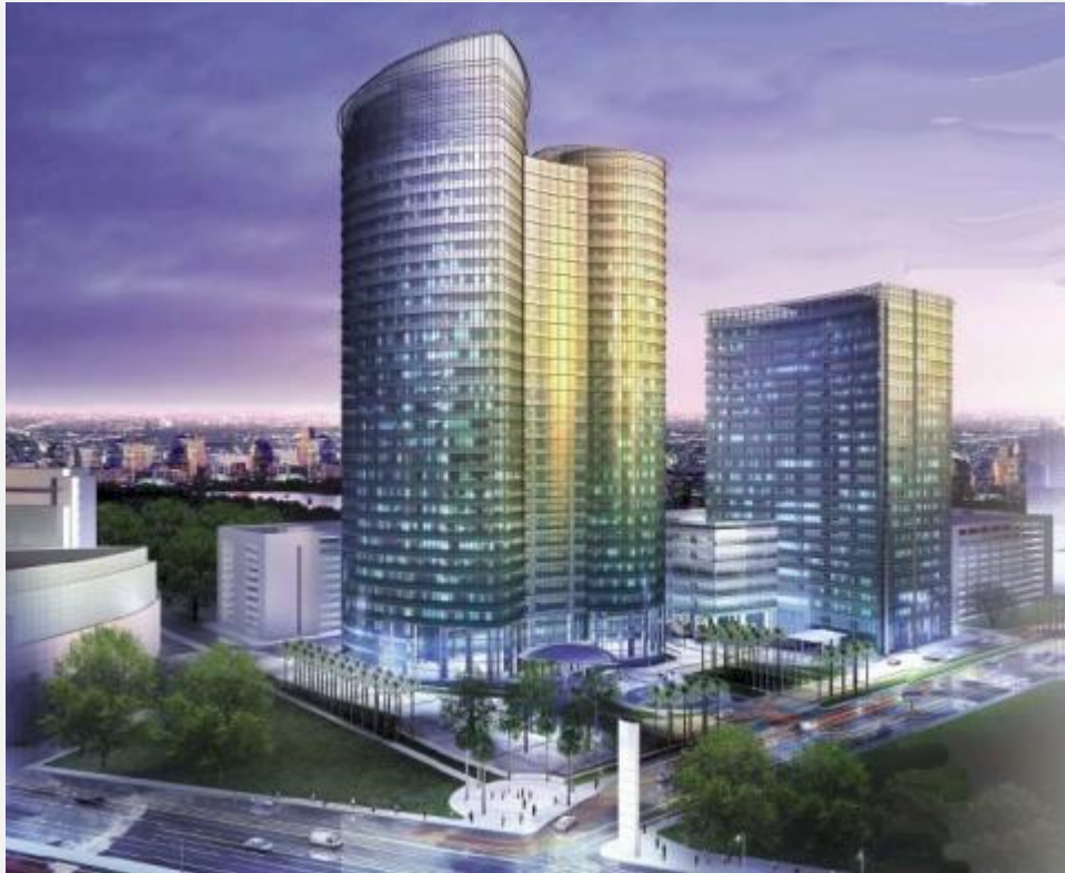
Energy Complex Building (PTTI HQ is located on 5 th Floor Tower B)